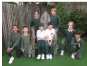
Junior Travel Ambassadors