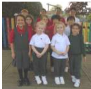
Rights Respecting Champions