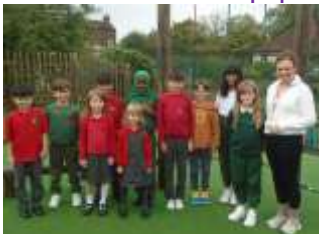
Healthy Living Council

Here are some of our pupil voice groups: