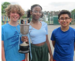
Junior Sports Day