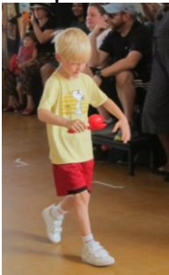
Infant Sports Day

This term has been another busy term of sport. We have continued with our swimming lessons – catch up classes for Year 5. We have had lessons in school each week run by Non-Stop Action.