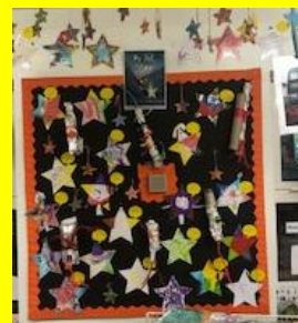
The Nursery Display