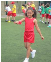
Infant Sports Day

Park this year. We won the girls relay and came second out of all Barnet medium sized schools. We also participated in the Barnet gymnastics competition and one of our teams won medals. The year ended with two lovely sports days that were very well organised and which had a great atmosphere.