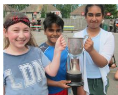
Junior Sports Day