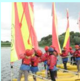
Y6 – A Week In Norfolk