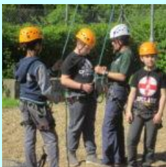
Y5 - 3 Day Adventure At Gilwell Park