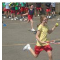
Junior Sports Day