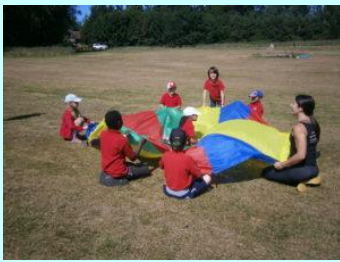
Y3 Team Work Day At Trent Park

This year we continued with a series of activities across KS2 as progression towards the week away in Norfolk for Y6. All of the activities were a great success.