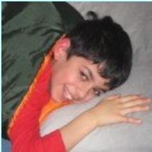
Y4 Sleepover Night