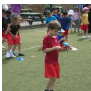
Infant Sports Day