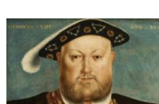
Year 4 Tudor Life