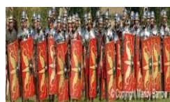
Year 3 Romans