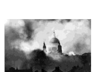
Year 6 WW2