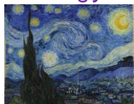
Year 1 Artists

As per normal each term, the teachers send out a newsletter letting parents know what the topic for the term is and how this relates to each curriculum area in outline. These have been e-mailed out this week and can also be found on the year group pages of the website. We hope that parents will find them useful. If you would like more detail about the objectives being covered, you can find this on the curriculum page of the website in the 'Learning Journey' section.