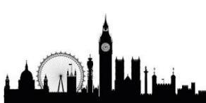
Year 2 London & The rainforest